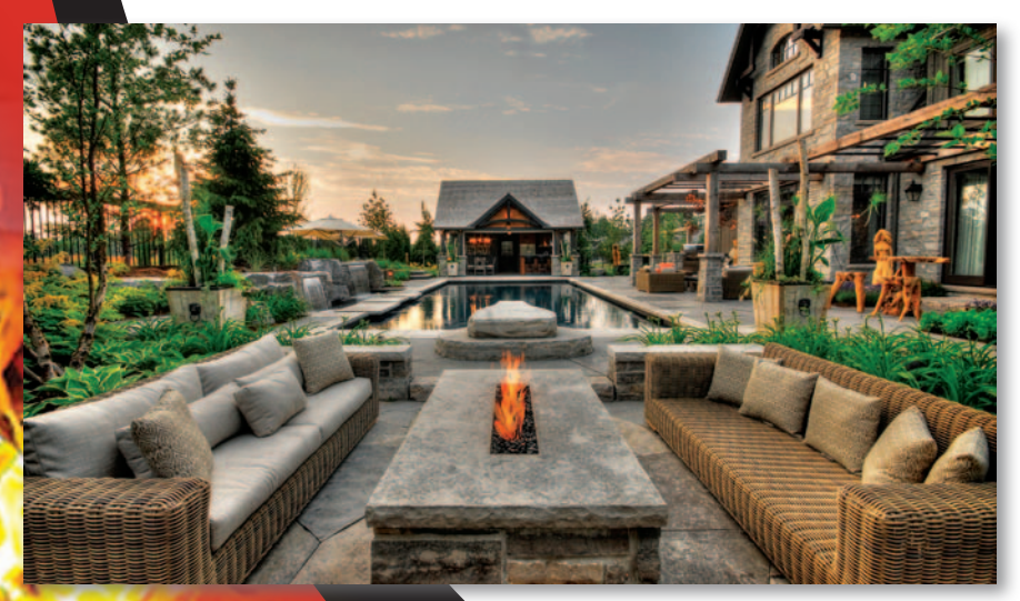
Dunington-Grubb Award 2014 presented to The Landmark Group