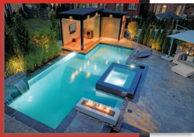
Casey van Maris Award 2014 presented to Betz Pools

The awards recognize the breathtaking design and master craftsmanship in landscape construction, maintenance and design projects created by Landscape Ontario members.